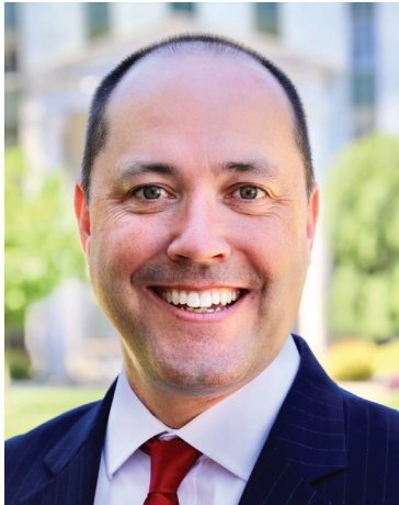
Chris Carr Attorney General of Georgia